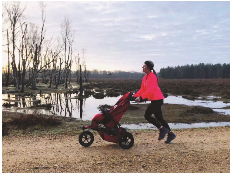
Buggy running, 6 months postnatal.

O'Sullivan (2015) found that running with a buggy leads to minor changes in trunk, pelvis and hip kinematics with no significant changes at the knee and ankle. Due to these changes in kinematics the authors suggest that flexibility work for the spine, pelvis, hips and gluteal strengthening exercises may be recommended for the runner.